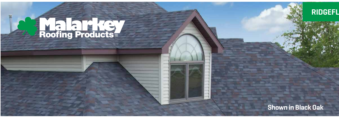
Shown in Black Oak